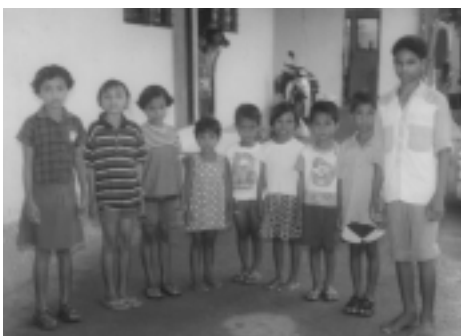
Some of the children at the orphanage in West Timor

Another recent project initiated by ARMS Darwin is a Child Sponsorship Project for children being assisted in a small orphanage in West Timor. This orphanage has a total of twenty children in care. Some of these children are from East Timor and have come from the refugee camps; others are from various locations in Indonesia. Each situation has been assessed and all the children who are in care are considered to be in desperate need.