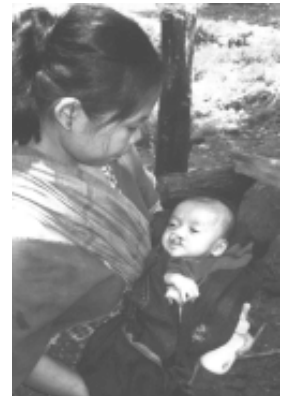
Tribal woman and child with hair lip