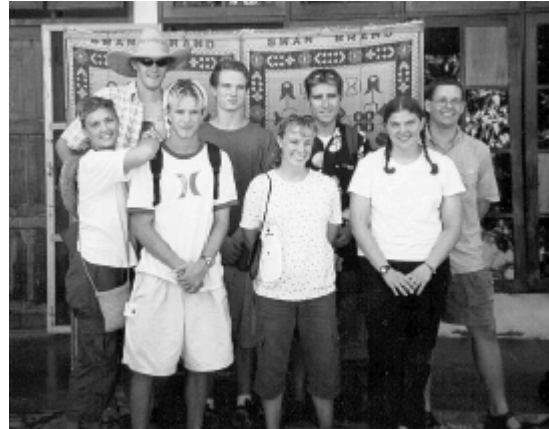
A team from Townsville in Dili

The last two teams sent in September 2000 and April 2001 had 10 – 12 members each. They were involved in teaching English, visiting the orphanages, assisting with building two new homes for Timorese families (and keeping the local kids around the sites amused and out of harms way), maintenance around the base, bible studies and ministering at the english service of the local church.