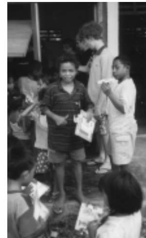
Team with children in East Timor

Earlier this year we established our School Project to see funds raised specifically to purchase basic educational supplies for children in East Timor. This project is still receiving donations. So far $896 has been raised which has supplied school items for more than 200 children.