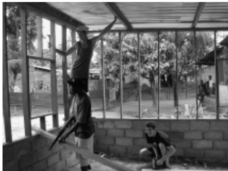
A building team in East Timor February 2001

The National Office has stirred up interest in the work in East Timor particularly amongst Youth With A Mission centres within Australia. So far teams from Tasmania, Perth, Darwin and Townsville ministered in East Timor either involved in Primary Health Care, or the building program. A team from Melbourne that was to have visited East Timor but was diverted to West Timor due to security problems.